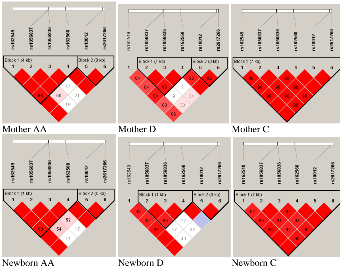
Figure 2. LD analysis of CYP1B1 gene in AA, D, and C. Different patterns of LD structure were observed in the three populations. Two different haplotype blocks were defined in AA and D, and one haplotype block was defined in C.